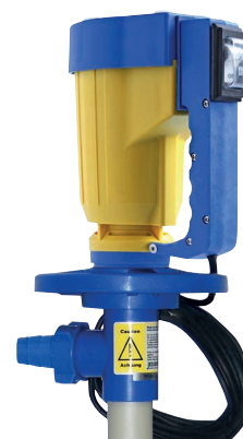
Electric laboratory pump JP-120/JP-140 motor with laboratory pump tube (25-32 mm)