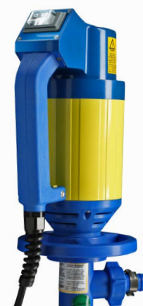
Electric drum pump JP-160/JP-180/JP-280 motor with pump tube (41 mm)