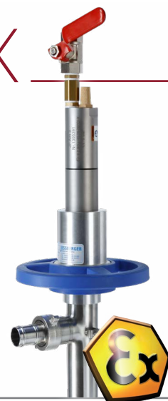
Air operated drum pump JP-Air 1 motor with pump tube (41 mm)