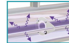
Patented wiper mechanism for quartz sleeve cleaning