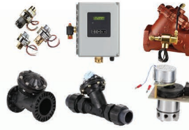
Control Valve & Stager Control