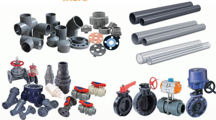
UPVC, CPVC Pipe / Fitting / Valve