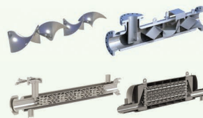
Static Mixer & Heat Exchanger