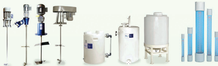
Agitator, Mixer, Tanks & Calibration Column