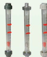
Variable Area Flowmeter