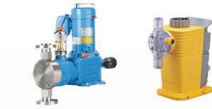
Motor-Driven Metering Pump