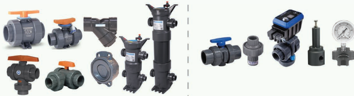
UPVC, CPVC Valve / Strainer / Filter and Instrument