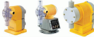
Solenoid-Driven Metering Pump